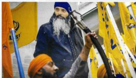
Demonstrators outside the Consulate General of India in Vancouver after the shooting of Hardeep Singh Nijjar, a Sikh separatist leader in June. (FILE PHOTO)